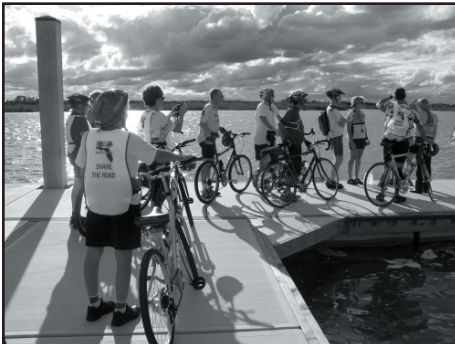
Close the Gaps Club members on the St. Johns River-to-Sea Loop ride in November 2009 awaiting the water taxi bound for New Smyrna Beach, Florida.

Together, we are transforming our East Coast Greenway dream into an emerging reality.