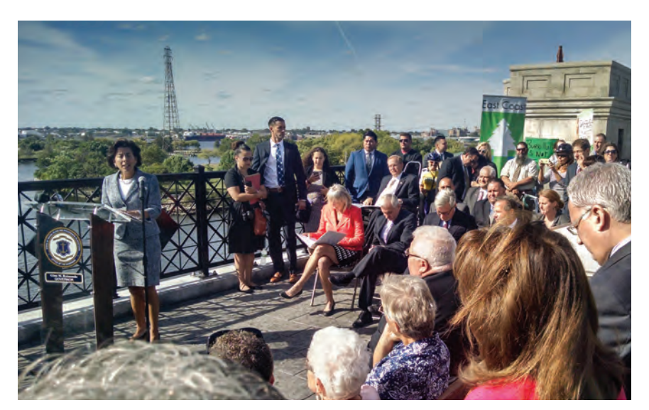
Rhode Island Governor Gina Raimondo addresses the crowd at the dedication of the George Redman Linear Park section of the ECG in Providence, RI.