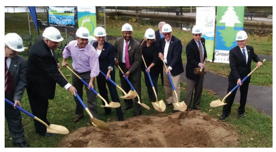
Former Mayor Nutter (center) and other leaders at the groundbreaking of the Baxter Trail segment of the East Coast Greenway in Philadelphia, PA.