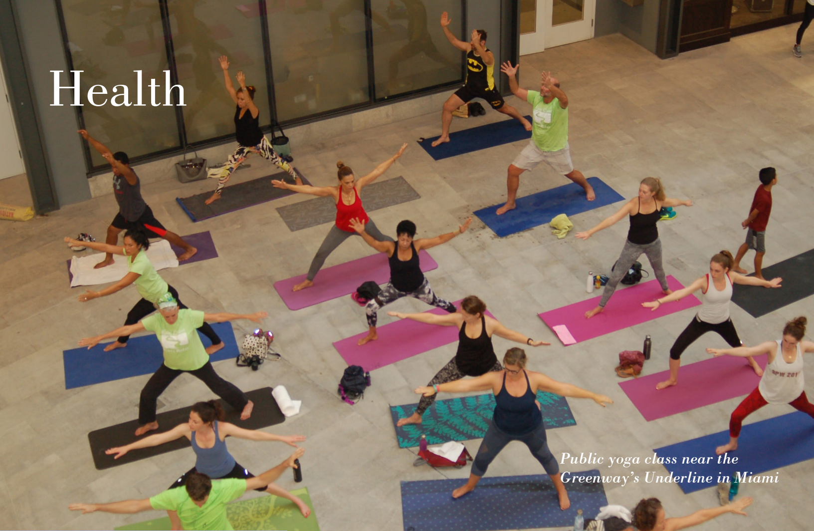
Public yoga class near the Greenway's Underline in Miami