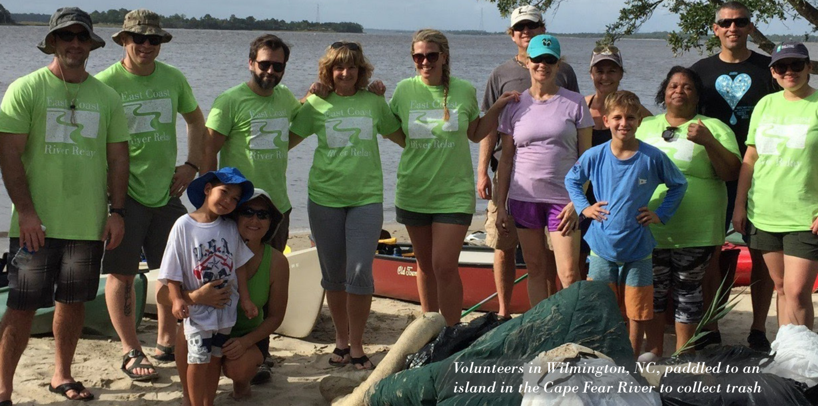
Volunteers in Wilmington, NC, paddled to an island in the Cape Fear River to collect trash