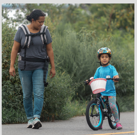
Above: Celebrating the Laurel Island Parkway Trail, Kingsland, Georgia's newest segment of the East Coast Greenway, alongside local partners in July 2021.